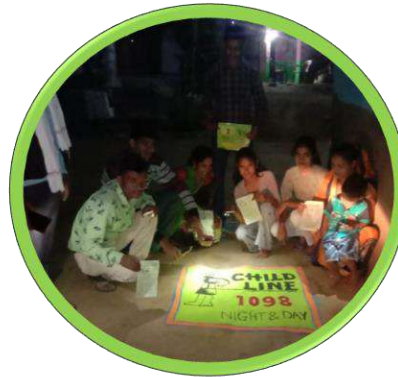
Rangoli Competition Prog.