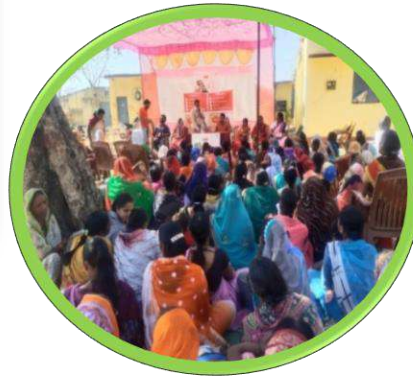
Nabard & Airtel Payment Bank FLC Prog