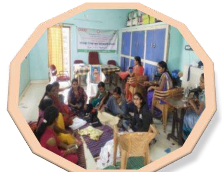
Usha Satellite Shilai School Training Prog