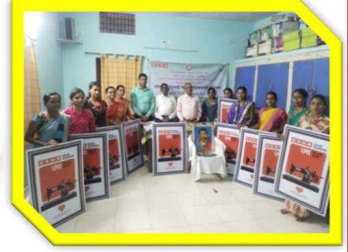
Usha Satellite Shilai School Certificate, Display Board Distribution Program