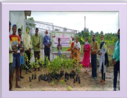
Tree Planation Prog.