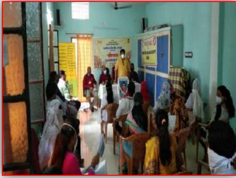
Choupal Hastakala Awareness Program