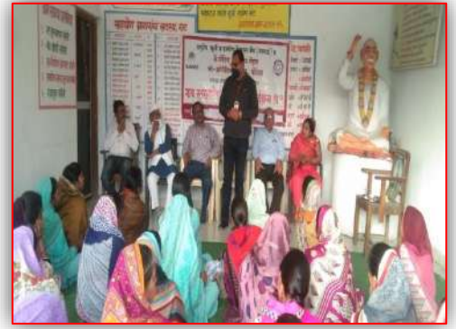
Nabard-DCCB Bank VLP Prog