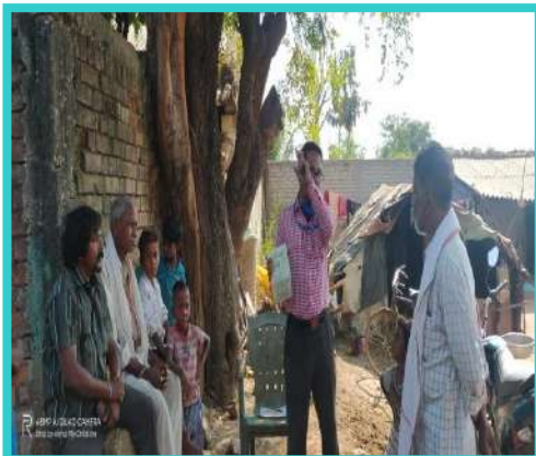
Center Co-ordinator Childline Gondia during the case follow-up and giving guidance on 1098 Service