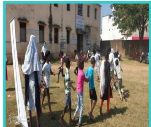
Childline Gondia team performing an Open House program with children's.