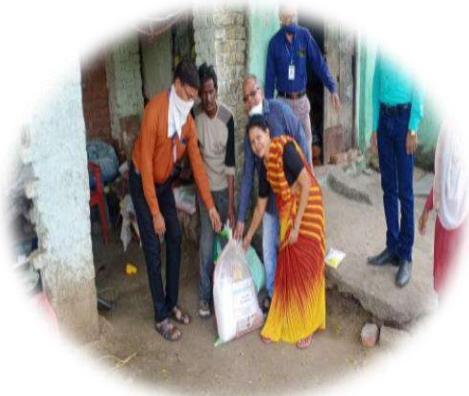
Distributing ration kits to poee family in Covid- 19