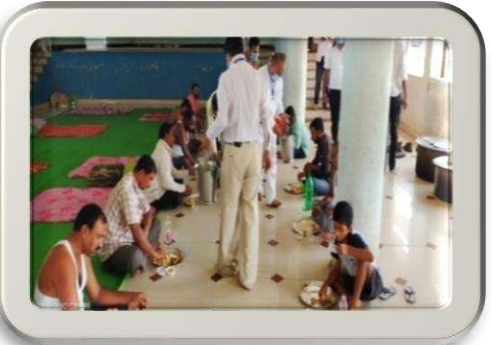
Food Supply to Nivara shelter in Lockdown situation .