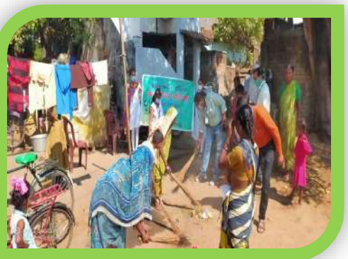
Swachh Bharat Mission Activity Prog