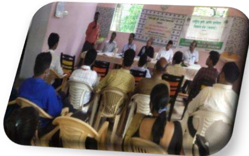
NABARD- JLG NGO Meet Prog