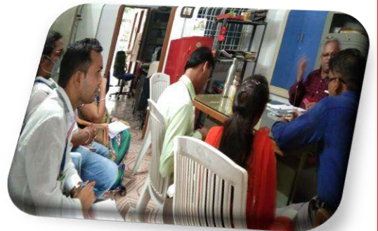
Staff meeting with ISWS Director