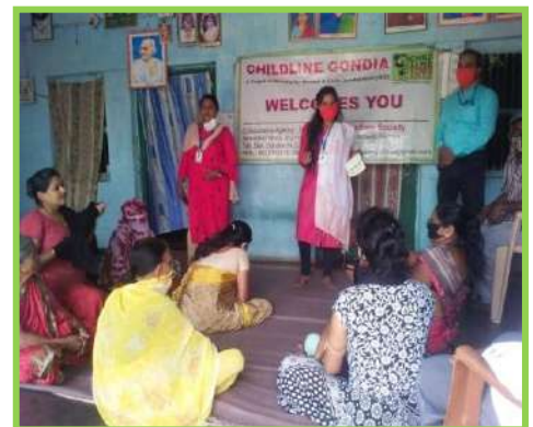
Child line 1098 Awareness Prog. in Anganwadi