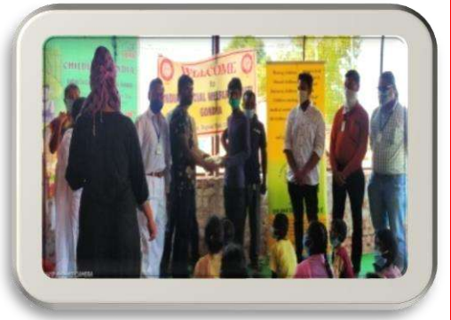
Readymade Cloth Distribution Prog to poor Children Diwali Festival