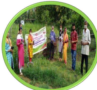
Tree Planation Prog.