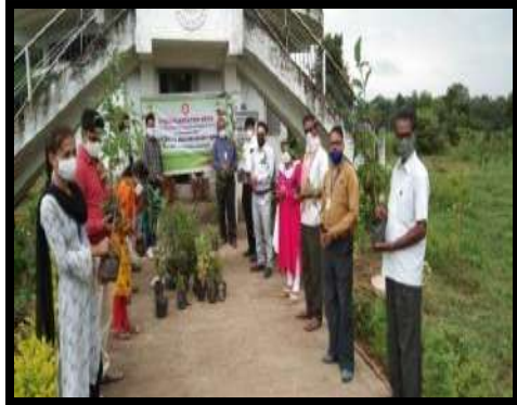
At Sukhdevtoli village of Gondia District in Budhh vihar primacies All participants toghter at the time of Fruit tree planting Program