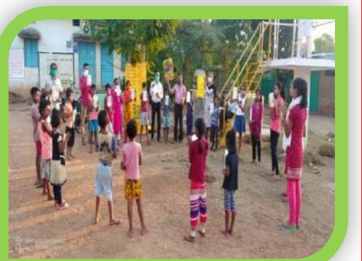
Open House Prog. for children's,