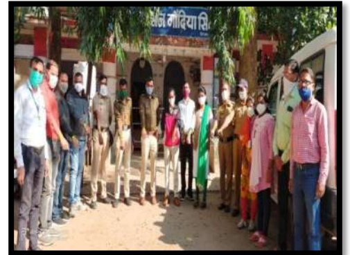
Band Tyging Prog. with Police Department