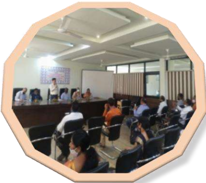
NABARD- JLG Training Prog