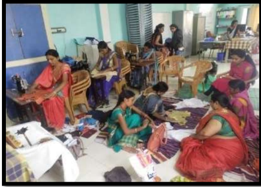
Usha Satellite Shilai School Program Beneficiaries shilai Work & cloth cutting work on Shilai Machine