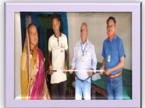
ISWS Childline Gondia Support to Blind Child by providing him Blind Stick.