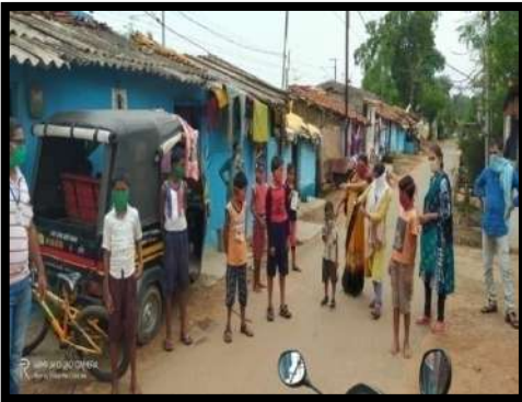
Distribute Mask & Sanitizer to Children in Covid 19